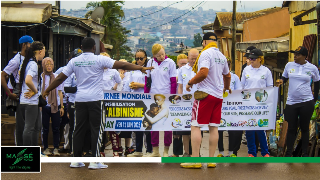
International Albinism Awareness Day – Cameroon 2025