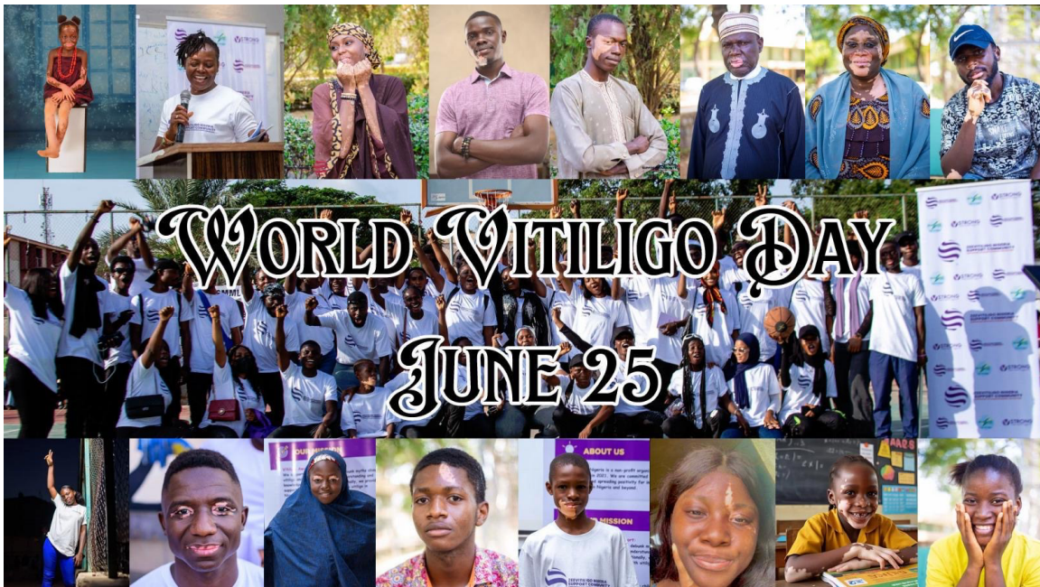
World Vitiligo Day – Nigeria 2025

Volunteer Engagement: Over 60 volunteers across Cameroon, Congo DRC, Ghana, Nigeria, Senegal, and the U.S. participated in direct support, mentorship, and awareness campaigns.