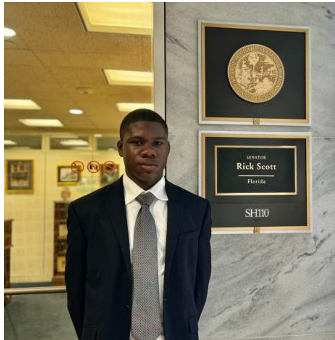
Coalition of Skin Diseases Hill Day – Capitol Hill, Washington DC 2025

Scholarship recipients: 9 high school students, 3 in Cameroon, 3 in Senegal, and 3 in Ghana received a full scholarship for the 2025-2026 academic school year. One college student in Kenya was awarded a full four-year college scholarship for engineering studies.