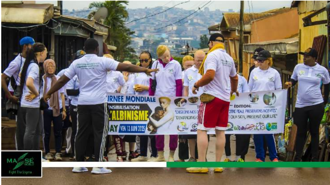
International Albinism Awareness Day – Cameroon 2025