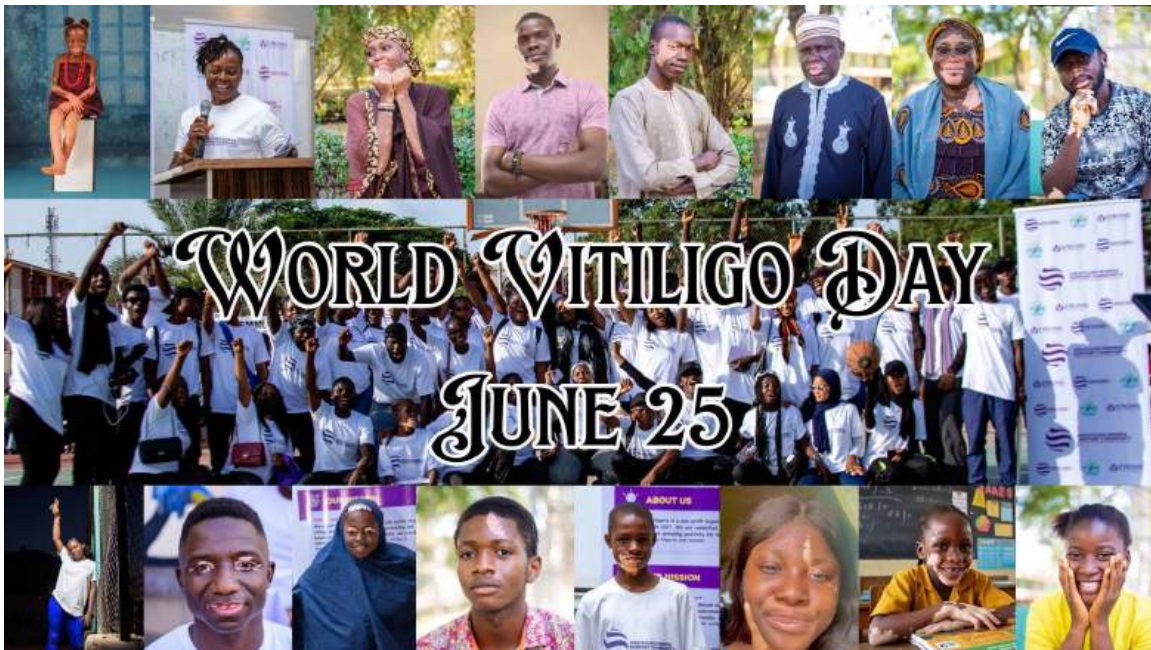
World Vitiligo Day – Nigeria 2025